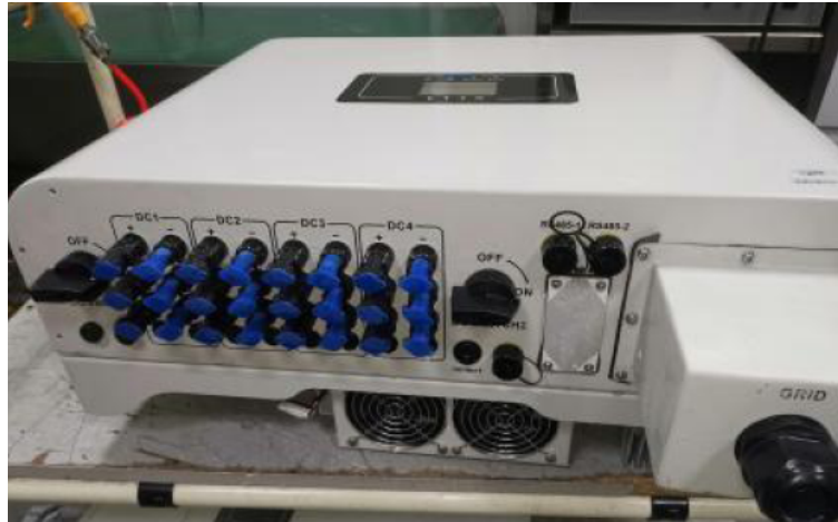
PIC3: Sample Photo, after IPX5 test