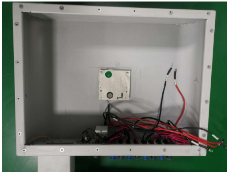
PIC4: Sample Photo, after IPX5 test, no water inside