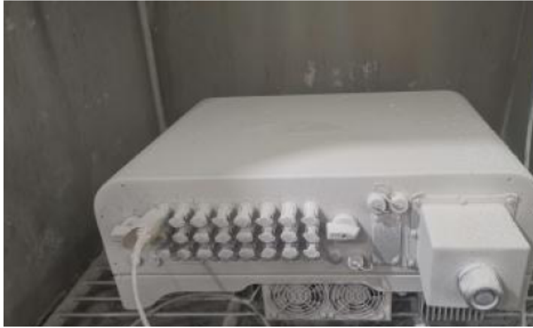
PIC1: Sample Photo, after IP6X test