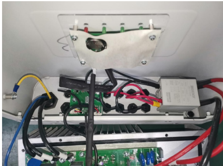
PIC4: Sample Photo, after IPX5 test, no water inside