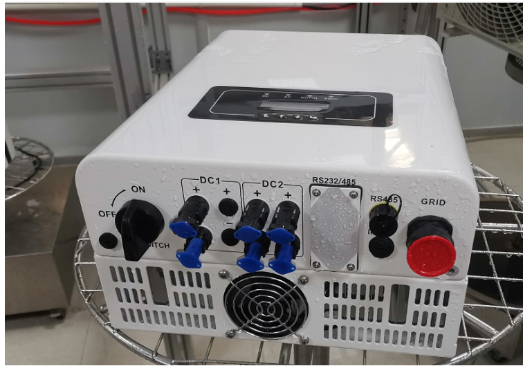
PIC3: Sample Photo, after IPX5 test