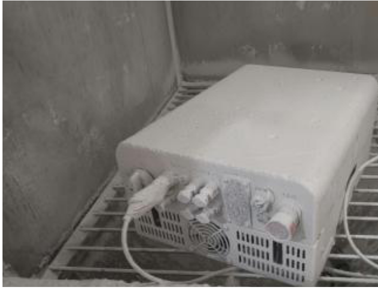
PIC1: Sample Photo, after IP6X test